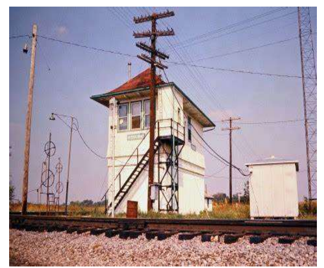
Ridgeway Tower, Western MP 81

2022 Notes : Brakemen get acquainted with only two classes of people in the general public in this job - friendly neighbors and furious motorists. The former typically enjoy chatting across the fence while our caboose is stopped opposite their back yard or farm corral, sometimes offering food and drink. They are used to the trains. The horn does not wake them or upset the cows. They understand that if their pig is hit by a train, the cause is insufficient fencing on their part, not failure to keep a lookout on ours. Motorists blocked by a train at a grade crossing are the opposite. Unfortunately, north of Columbus the T&OC runs through very flat country, and there are only a handful of highway grade separations in the entire 131 miles. Thankfully we only see these motorists in a couple places, especially when a switching train blocks the highway at Ridgeway, or when an auto makes an insane dash around the lowered flashing gates protecting a grade crossing. They hate us, threaten to call the sheriff, and are a disagreeable lot.