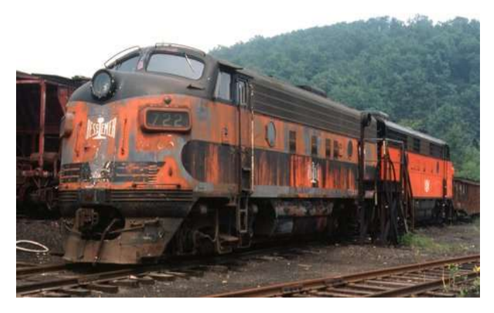
B&LE F7 covered wagons at Baylor, PA, 1976: <a href="https://blearchive.weebly.com/past-and-present-diesel-engines.html">https://blearchive.weebly.com/past-and-present-diesel-engines.html</a>